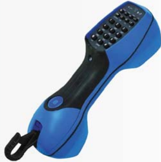
Alert 340 3 Year Warranty

Digital Service Detection, Fully Hands Free, Digital Service/ Hi Voltage Lockout and Alarm, ADSL Compatible