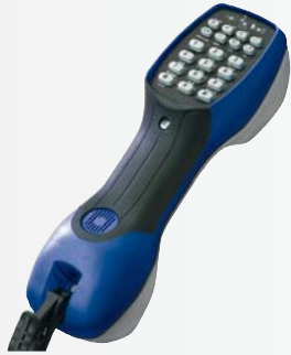
D361 (12KHz) 3 Year Warranty

Digital Service Detection, Fully Hands Free, Digital Service/ Hi Voltage Lockout and Alarm, ADSL Compatible